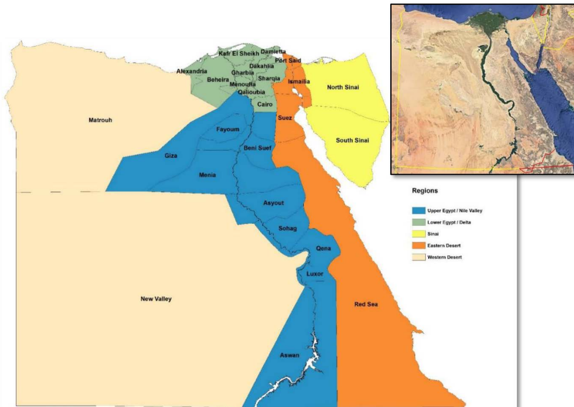
Figure 1 – Map of governorates and regions of Egypt, with satellite map