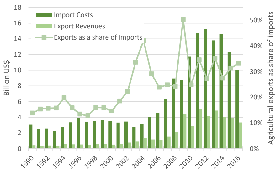
Figure 4 – Trends in value of Egypt's agricultural exports and imports, 1990 to 2016